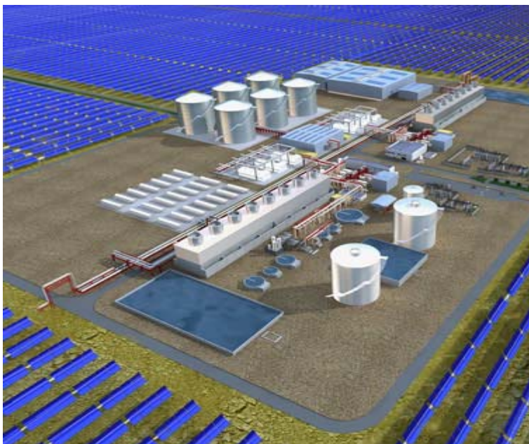
Artist Rendering of a Parabolic Trough CSP Plant